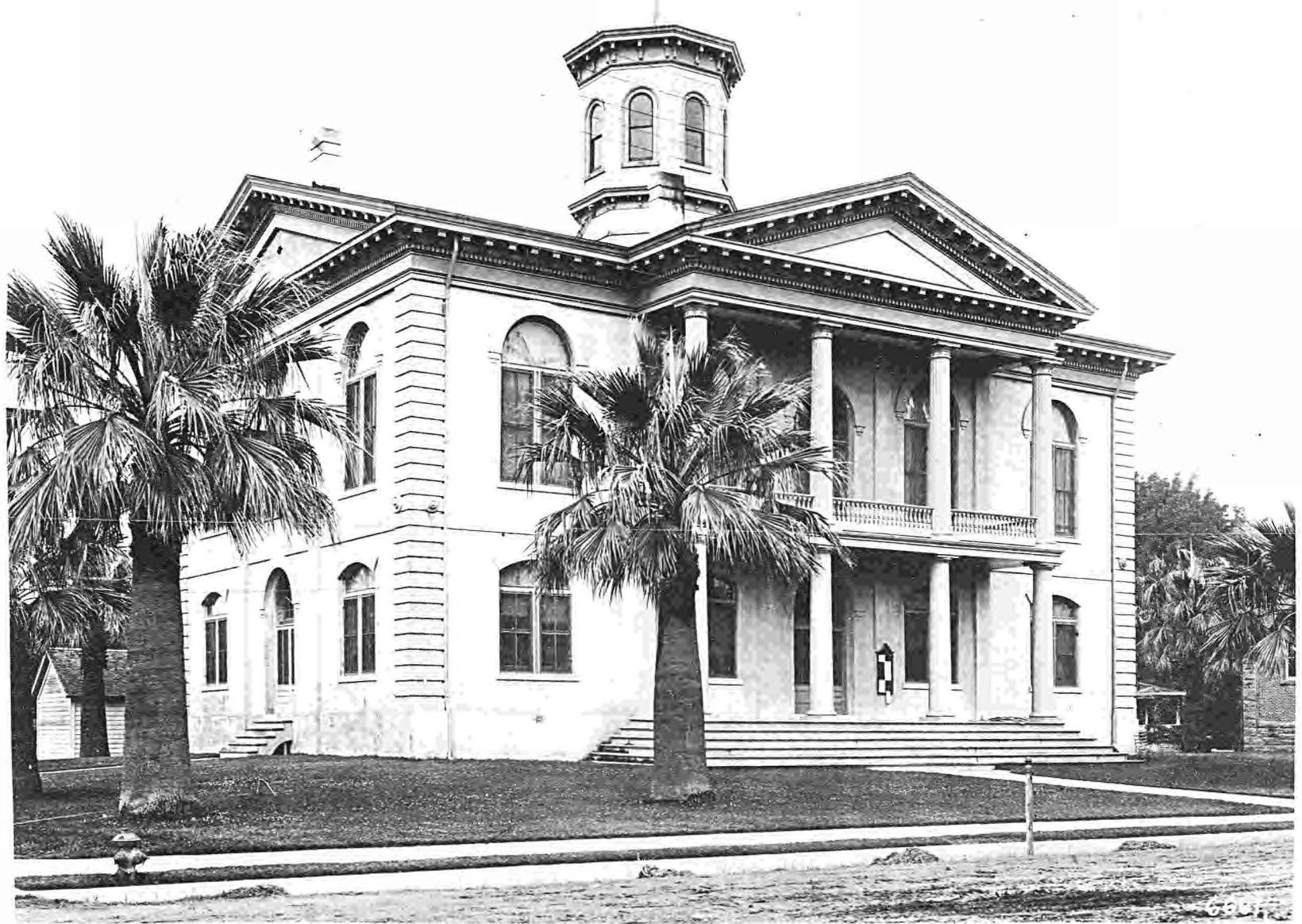
SUTTER COUNTY COURTHOUSE REBUILT (1900)