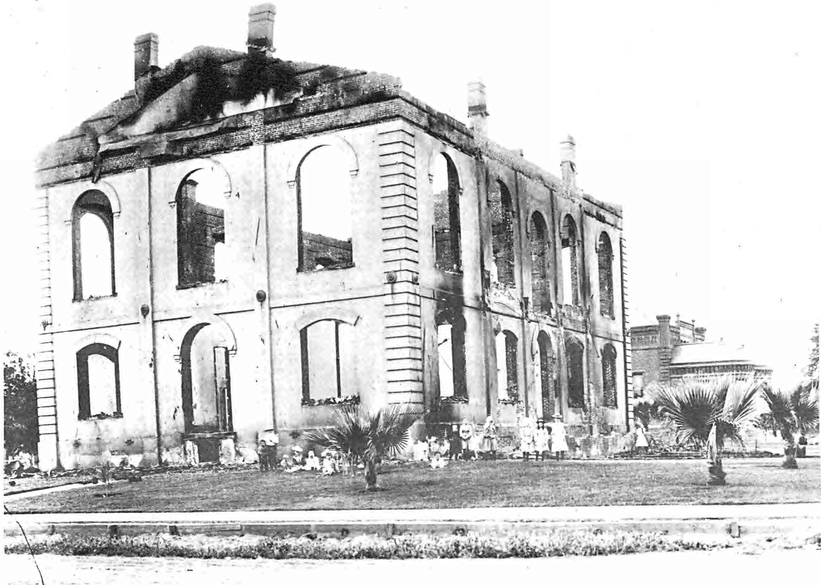
CUORHOUSE FIRE (APRIL 1899)