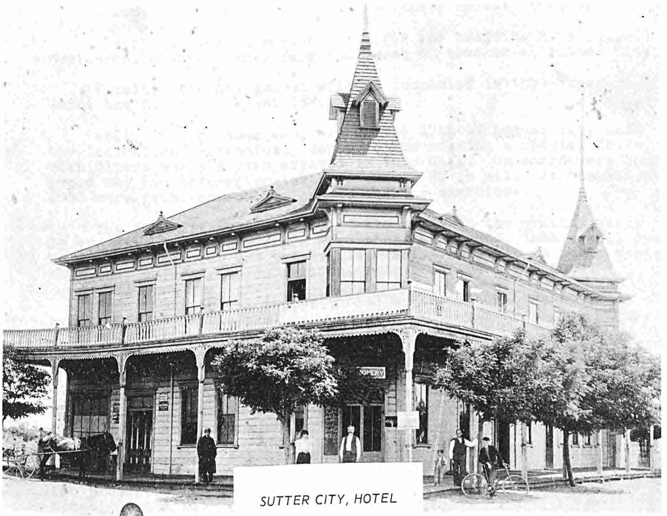
SUTTER CITY, HOTEL