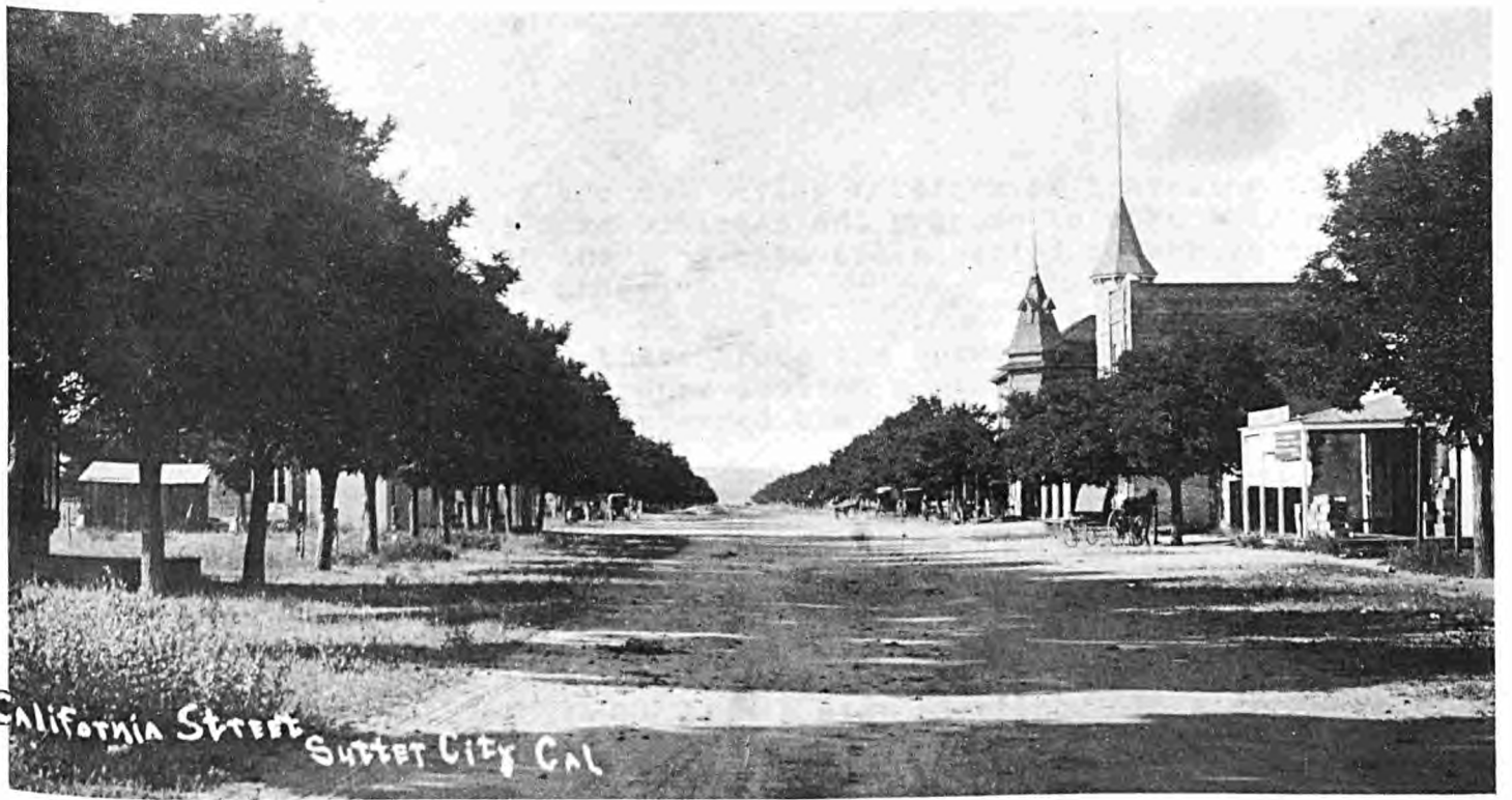
California Street Sutter City Cal