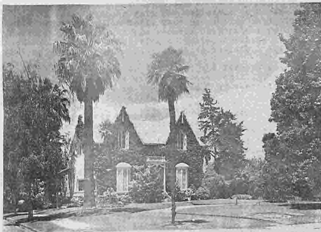
FALLS CHEIM HOME