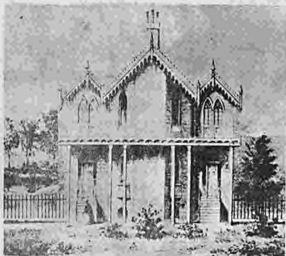
THE RAMIREZ HOME