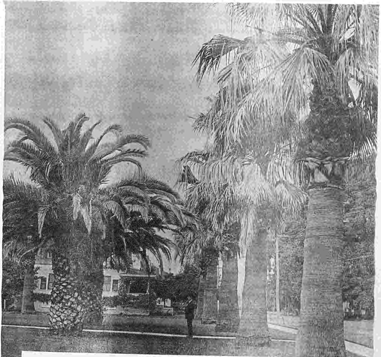
COURT HOUSE GROUNDS LOOKING WEST FROM THE CORNER OF 2ND & B ST.