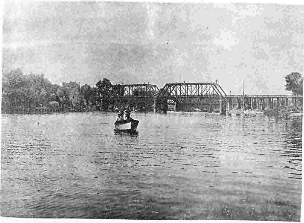
FEATHER RIVER BRIDGE BETWEEN YUBA CITY & MARYSVILLE LOOKING NORTH WITH S.P. RAILROAD BRIDGE IN VIEW TO THE NORTH (SOMETIME BEFORE 1955)