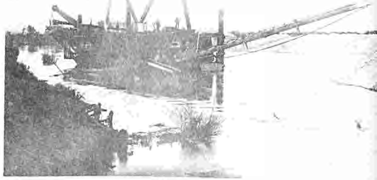
BUILDING LEVEES ON FEATHER 1907-1908