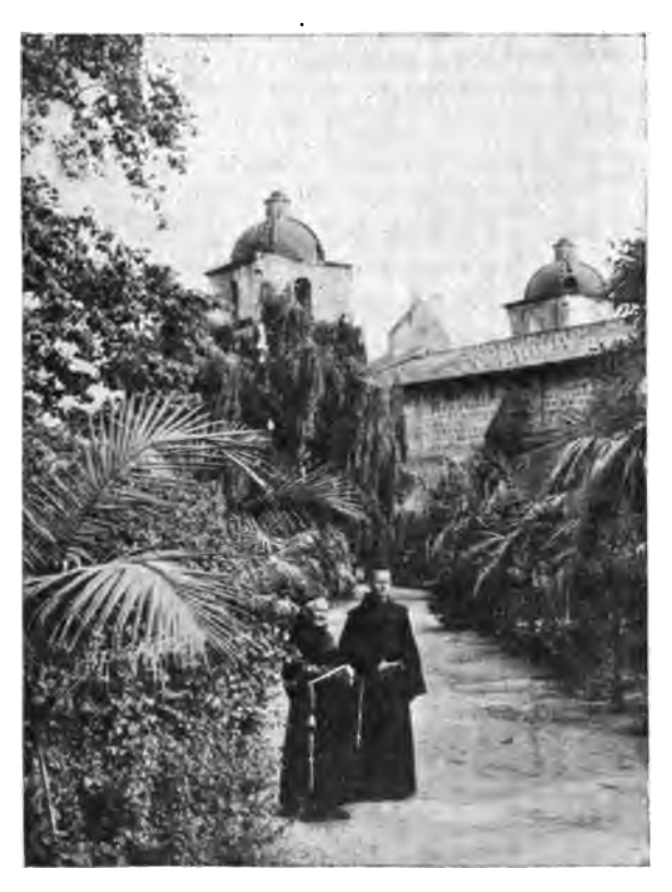
CEMETERY, OLD MISSION, SANTA BARBARA

But the Government did not enforce its laws in that regard and