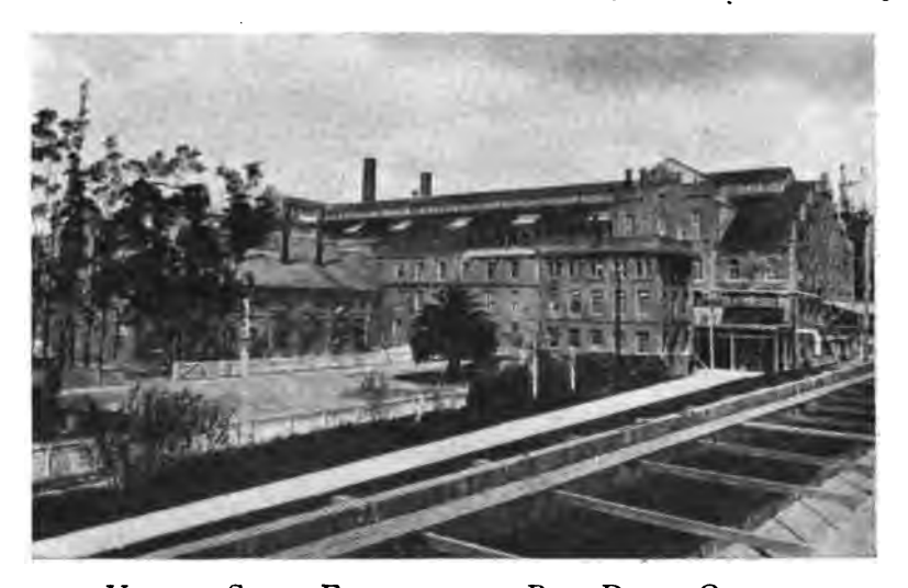
VIEW OF SUGAR FACTORY, FROM BEET DUMP, OXNARD

The output of sugar for the season just completed has been 850,000 bags, or 85,000,000 pounds. A new departure has been made during the season and there were many orders filled for 25