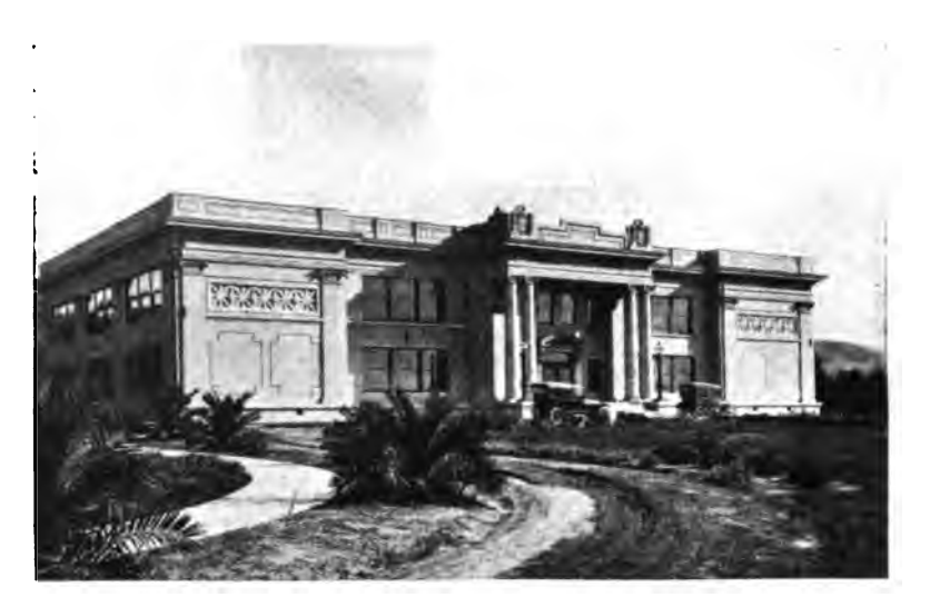
HIGH SCHOOL, VENTURA