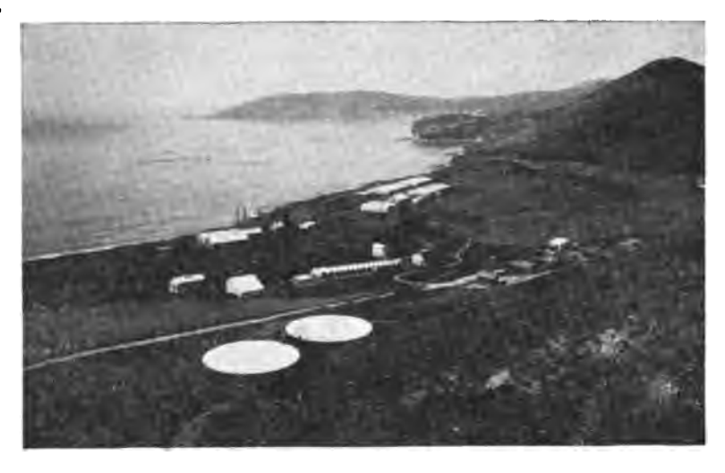
REFINERY AT OILPORT

avidity the unhoped-for chance to realize something, if only a promised royalty, from land which they had hardly reckoned as an asset. Stock companies were speedily formed and stock launched upon the "market," and it was only the very strong-minded who resisted the temptation to take a few blocks of stock. "Rigs" were erected and multiplied with marvelous rapidity and dotted the land-scape and night and day drilling was diligently prosecuted. Favorable "prospects" were invariably met with, and when it became necessary to levy assessments to continue the work they were for a time quite cheerfully and generally met. But gradually after several years of persistent effort the excitement died out, new ventures