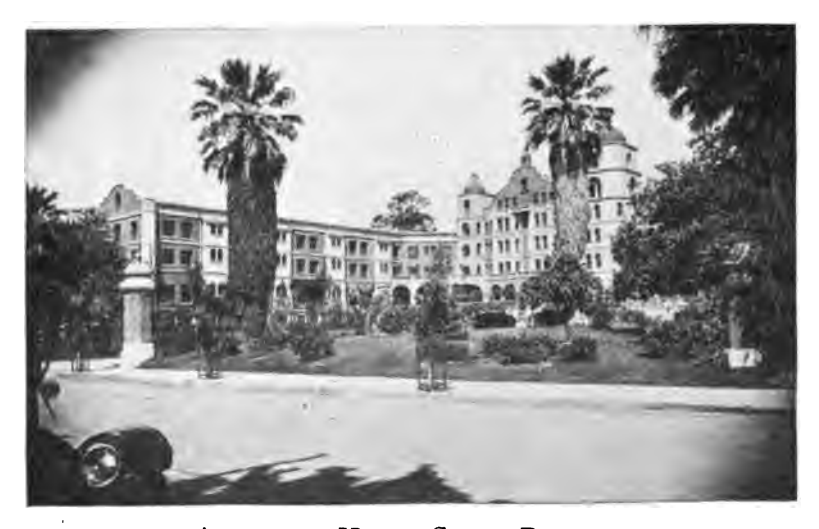
ARLINGTON HOTEL, SANTA BARBARA

When the San Carlos (St. Charles) was opened for guests, crude though it was, it was considered a great credit to the city. The view we give in this history is that of the hotel before any other buildings were constructed near it. In its later days it became so crowded by its neighbors that few who have seen it in its old age realized what