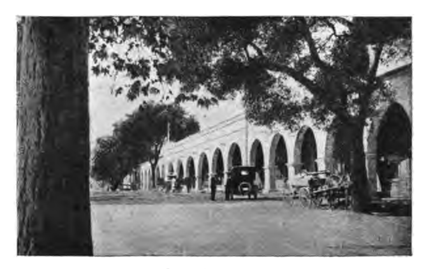
ARCADE, OJAI AVENUE, NORDHOFF

The road became a popular driveway and continued to be the main