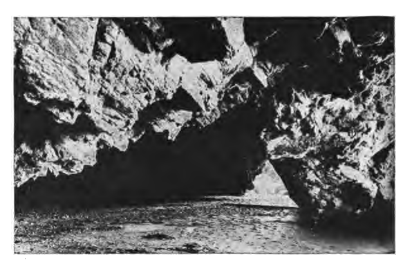
VALDEZ CAVE, SANTA CRUZ ISLAND

All but two of the Channel Islands derive their names from that Saint whose festival the church commemorated on the day of discovery. To these two the padres gave appropriate names. One of