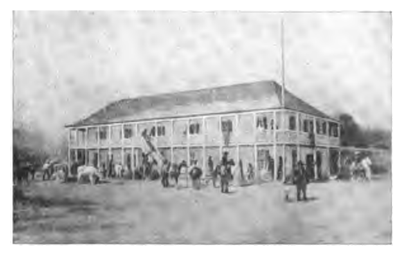
SAN CARLOS HOTEL

Landing on the beach from the steamer by means of a lighter, a wave overtook him before he could recover the use of his legs, wetting him thoroughly and washing his carpet bag out of his hands, which had eighteen thousand dollars in gold in it. The retiring wave exposed it so that it was recovered. It was now quite dark and raining fearfully. Mission Creek was up and there he got another wetting for there was no bridge or other means of