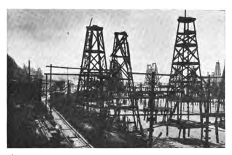
OIL WELLS IN THE PACIFIC, SUMMERLAND BY THE SEA

One in the canon of the east branch of the Carpinteria Creek in