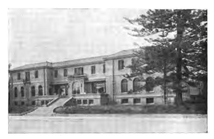
Y. M. C. A. Building, Santa Barbara

We can think of no decade in the history of Santa Barbara County, that for interest and excitement, equaled the period from