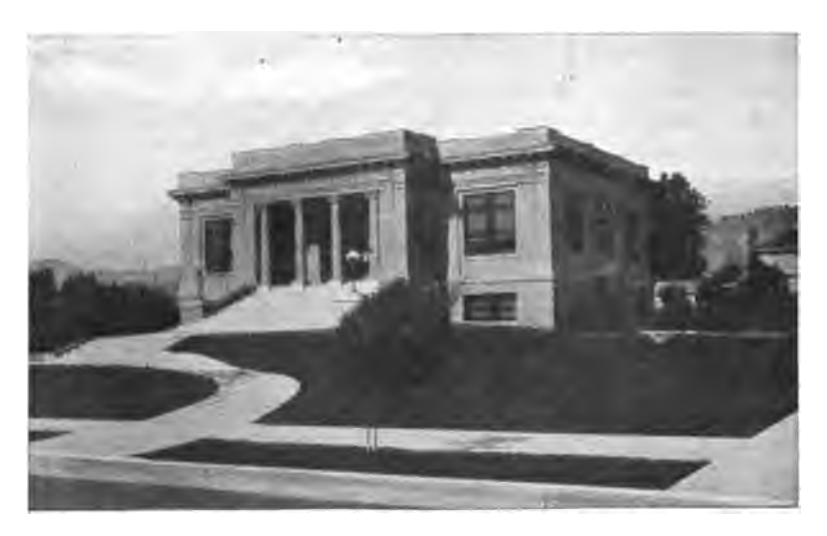
BLANCHARD'S MEMORIAL LIBRARY, SANTA PAULA

Santa Paula continued to grow right along. She is alongside the growing towns of the other sections of the county in every particular, and, like many another California town, classes first among her numerous attractions her fertile soil and equable climate. At an elevation of 285 feet above sea-level, Santa Paula is justly proud of an average yearly temperature of about 75 degrees at 2 p. m.