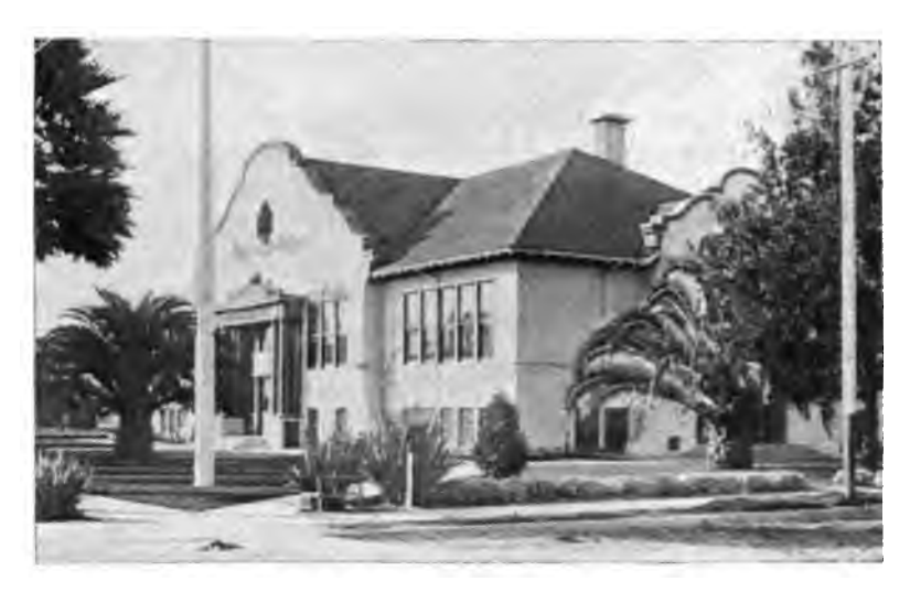
Oxnard High School