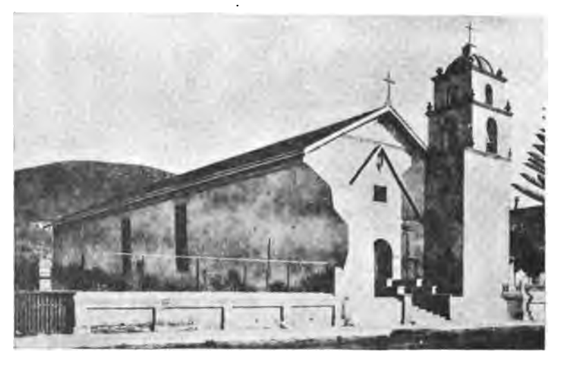
SAN BUENAVENTURA MISSION, VENTURA

ulation at the time was but 731 people, mostly of the Spanish, Mexican and Indian and the mixture, and this population was largely gathered immediately about the mission. The vast section of country now known as Ventura county was given over to grazing and there was scarcely a hut in the whole country. The productions of that small part which was cultivated showed of wheat 1,750 bushels, corn 500 bushels, beans 400 bushels, barley 2,000 bushels. This product all belonged to the mission. In the first year following seculari-