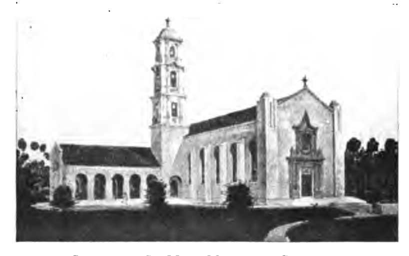
CHURCH OF ST. MARY MAGDALEN, CAMARILLO

Fillmore Union High School has been in existence six years and in that time has grown from a teaching staff of three and an attendance of twenty, to a faculty of eight and attendance of about one hundred and twenty-five, and is the second school in the county in point of daily average attendance. The re-inforced concrete building, in beautiful mission style, makes an attractive picture as it sets back in the spacious lawn, and is much admired by all visitors as well as Fillmoreites. This educational plant represents an investment well over the $50,000 mark and is constantly being added to. The eleven and a half acre tract owned by the district fur-