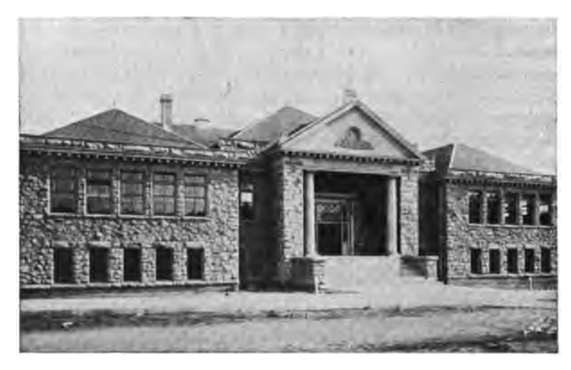
HIGH SCHOOL, SAN LUIS OBISPO

The number of schools in the county is about 100, employing 175 teachers. The schools are scattered conveniently throughout the county, the state wisely providing support for districts that would otherwise be without the service of teachers. Each of these schools enjoys the instruction of from one to three teachers if in a rural district and as many as thirty-four in the county seat. The high