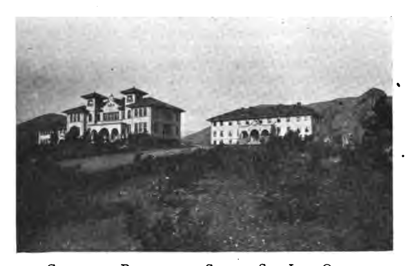
CALIFORNIA POLYTECHNIC SCHOOL, SAN LUIS OBISPO

have the opportunity of demonstrating how to succeed with inferior soil. The real and decisive consideration for the directors appeared to be that the tract skirted the Southern Pacific Railway and the school would afford an object of interest to passing travelers. The location settled, the next step was the selection of a manager or superintendent, presumably a man of wide experience in polytechnic work and whose high standing and reputation would aid in successfully launching the new venture. The directors appointed a young collegian of pleasing manners and address who was an instructor in the Dairy School of the State University. Buildings were then erected upon the plans of a rural architect,