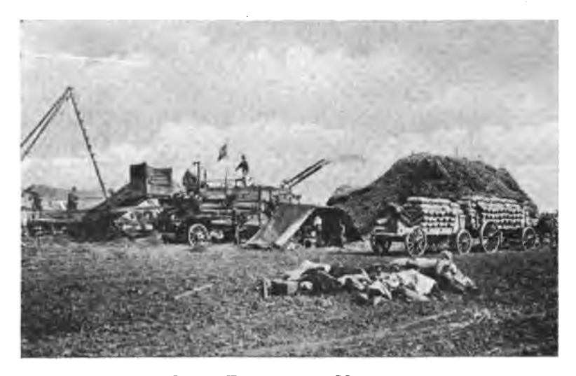
BEAN THRESHING, VENTURA

In the larger threshing plants there is an electric light plant attached, as work is often carried on into the night. When the dew is heavy from the sea it does not dry off the beans until late in the morning, and does not fall again until late at night. It is com-