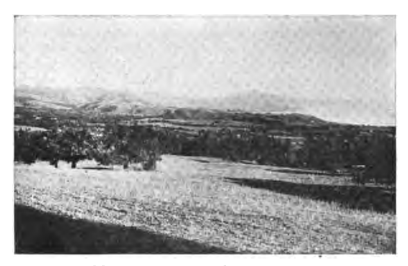
MONTECITO VALLEY, SANTA BARBARA

The land has been gradually purchased from its Spanish owners