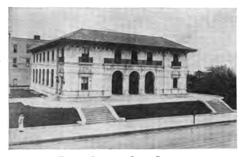
FEDERAL BUILDING, SANTA BARBARA

conservative citizens caught the fever of speculation and from day to day, nothing was heard but "lots," "subdivisions," "additions" and "townsites." Blocks in the suburbs of four and a half acres, without streets, water, sewerage or light, sold as high as $30,000 or more and $50 per front foot was a common price on unimproved streets. Much farm land was subdivided into city lots and sold to excited buyers, eager to unload on some one else at an advance. The climax of the boom was reached in August, 1887, when the first train came over the new branch line from Saugus on the 17th of that month. The occasion was a general