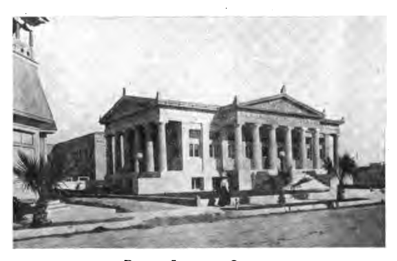
PUBLIC LIBRARY, OXNARD

And from that time on Hueneme was almost constantly a boom town. She developed into the one shipping point of the county and