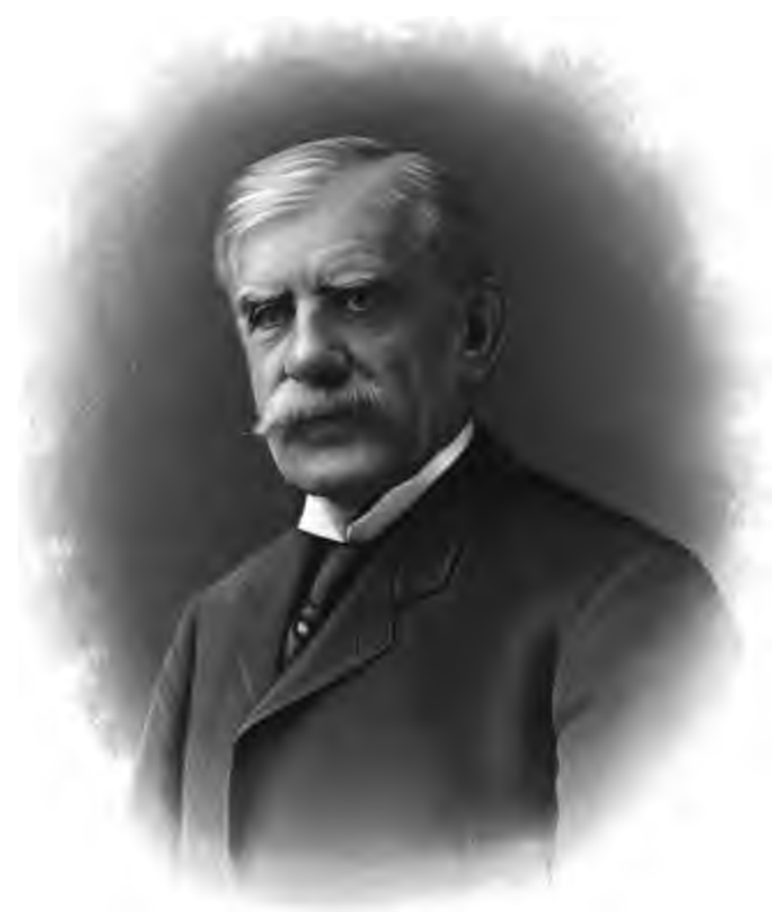
C. A. C. C. K. C. Kellenge of Fire 377