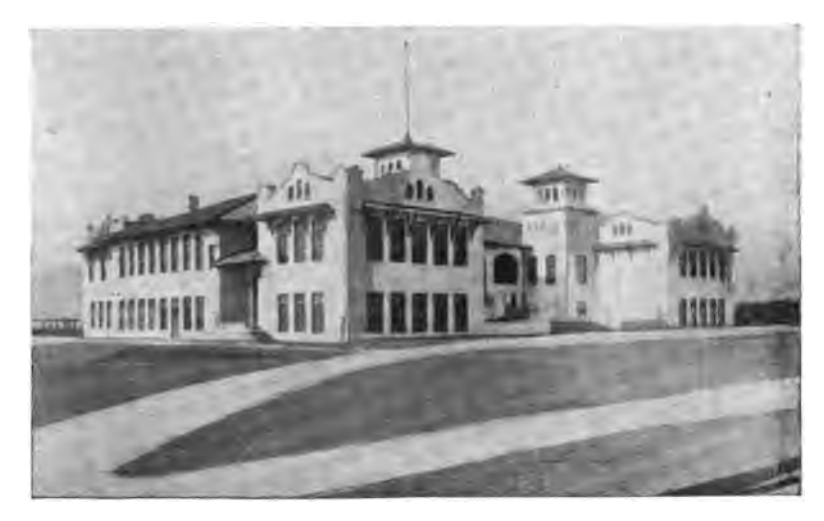
FILLMORE HIGH SCHOOL

In communities growing as fast as Fillmore, educational and church facilities usually do not keep pace with the growth of the town, but this is not true of Fillmore. Within the past three years