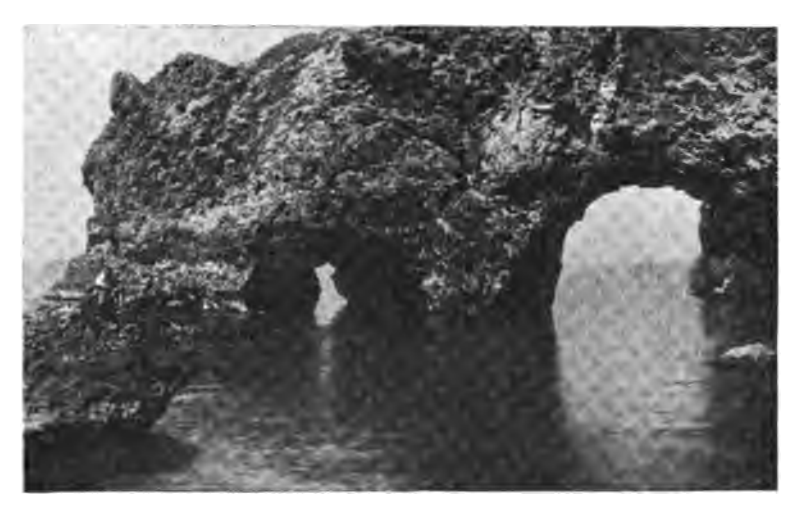
Arches on Anacapa Island

Two islands sitting far out in the Pacific ocean constitute parts of Ventura county. These are Anacapa, twenty miles from the