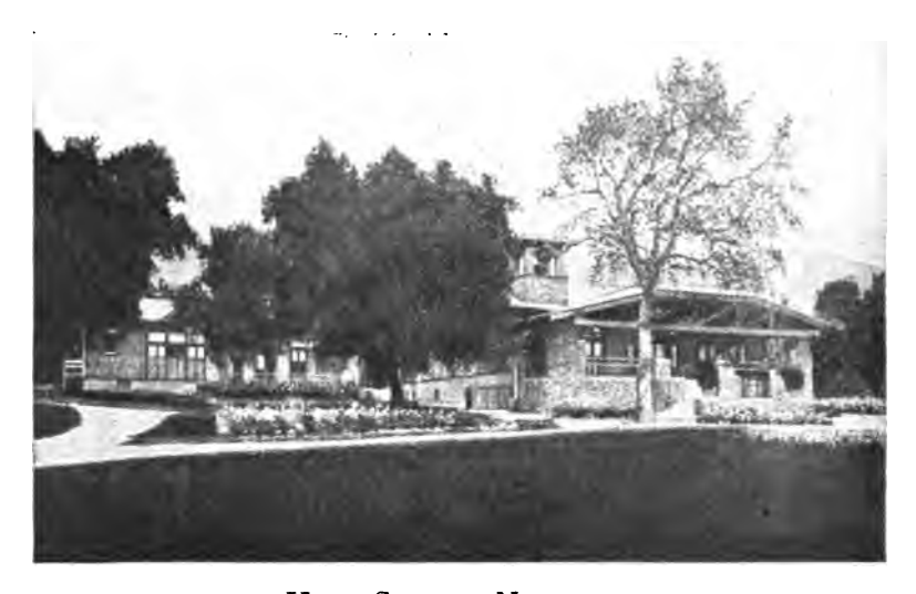
HIGH SCHOOL, NORDHOFF

Nordhoff contained some 300 inhabitants in 1891, many of whom were recuperated invalids from nearly every state in the Union. There were here two hotels, nestling under the splendid oaks, two churches, two school-houses, two general merchandise stores, two