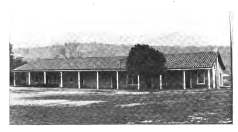
THE NEIGHBORHOOD HOUSE (BUILDING OF HISTORICAL INTEREST)

Previous to the American occupation, education was largely confined to the Mission fathers and to the wealthy families who could employ private teachers, and though at times efforts had been made by certain Spanish governors to establish a school system, failure had practically been written on them all.