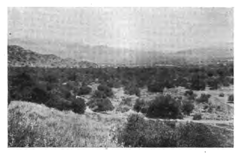
VIEW OF OJAI VALLEY

The Rancho Ojai adjoins the Santa Ana on the north and contains over 17,000 acres. In Indian the word "Ojai," pronounced O-hi, is said to mean "nest." The entire rancho is hemmed in