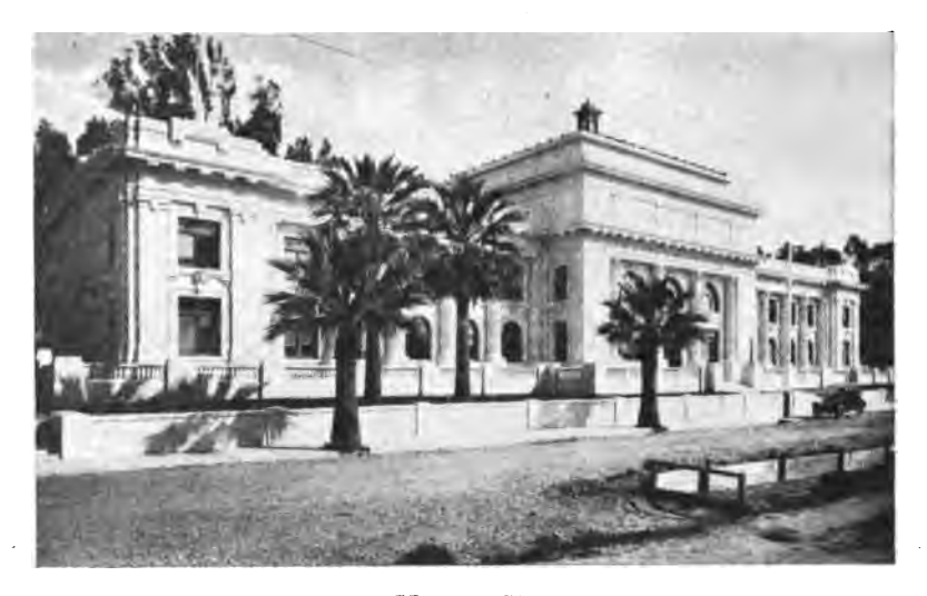
COURT HOUSE, VENTURA

The building cost, furnished, exactly $287,000. Yet, for that price, Ventura county secured a courthouse that every Ventura county citizen is proud of, and that stands unique as the one public