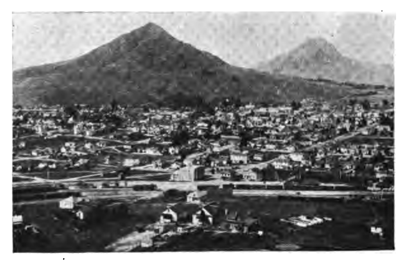
SAN LUIS OBISPO

up the rocky points it must have seemed a most sinister and menacing lee shore, to be skirted with apprehension and at a safe distance. Today under the same conditions, the skilled seaman guides his bark with all confidence into Port San Luis, where by the expenditure of a few hundreds of thousands of dollars, a breakwater has been constructed, within whose sheltering arm, great deep sea vessels dock with safety. And except when the infrequent gales of winter prevail, smaller vessels make safe landing at Point Buchon, at Cayucos and San Simeon, while the long smooth beaches afford a favorite resort for thousands fleeing from the inclement