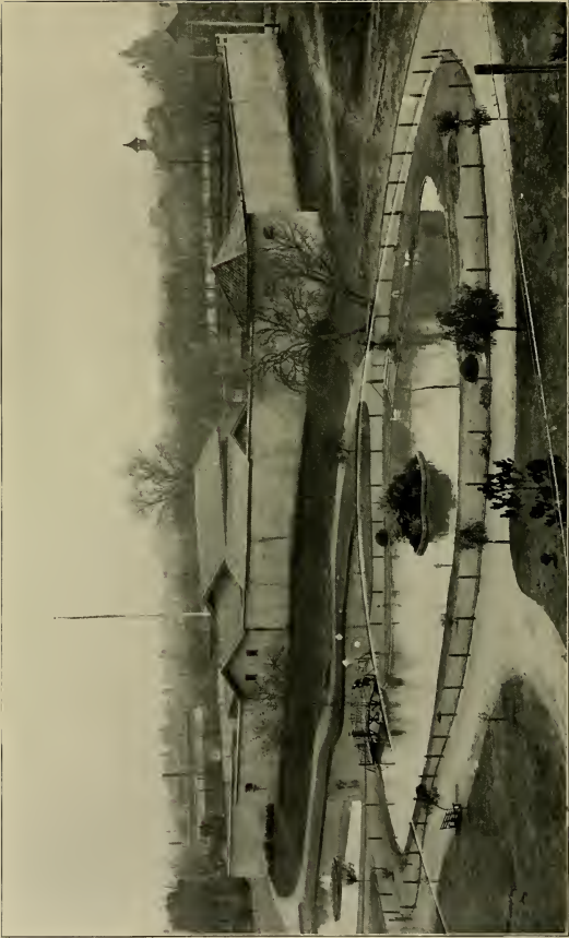
SUTTER'S FORT, FROM K STREET