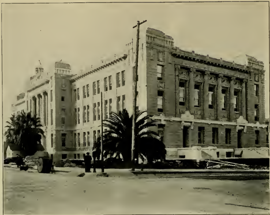
NEW COURT HOUSE