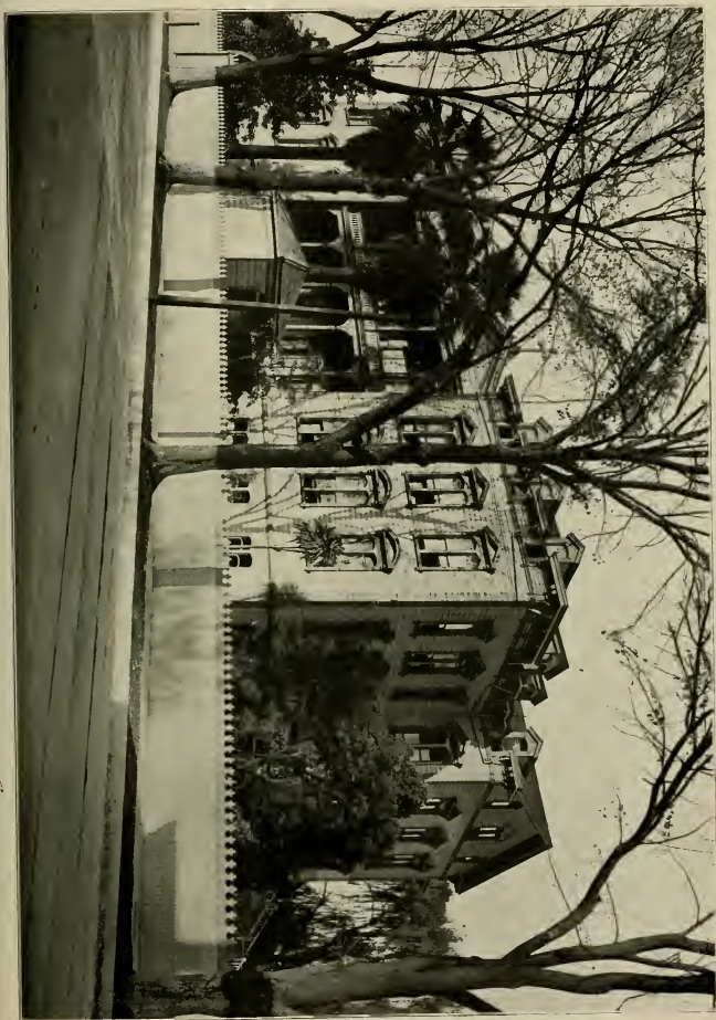
ST. JOSEPH'S ACADEMY