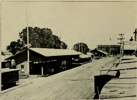
FIRST DEPOT OF THE SACRAMENTO VALLEY RAILROAD, BUILT IN 1862