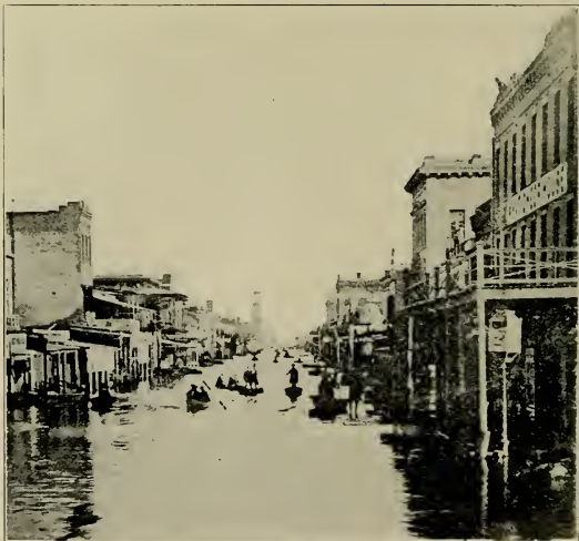
K STREET IN THE '62 FLOOD