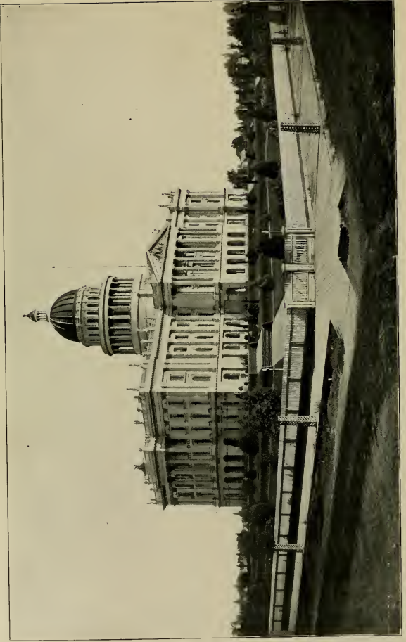
THE CAPITOL IN 1875