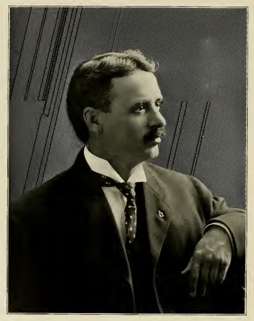
W, St, Butter