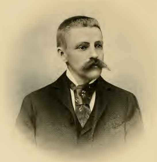
. w n // //s