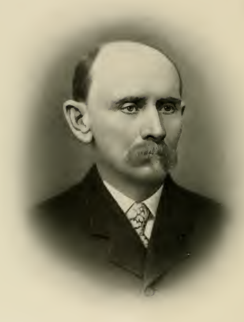
Im on Snoddy