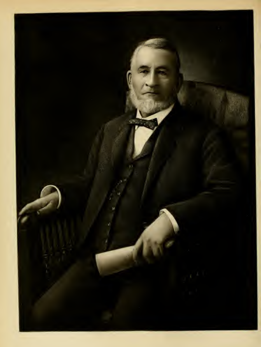
fotham Bix by