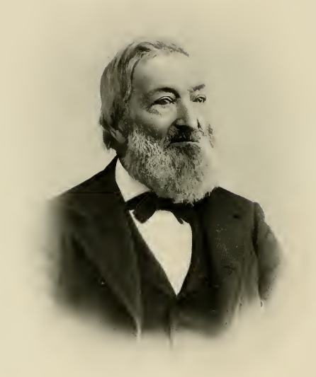
9 W Battles