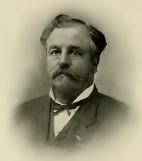
Philitis & lour