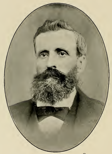
& & Gaskill