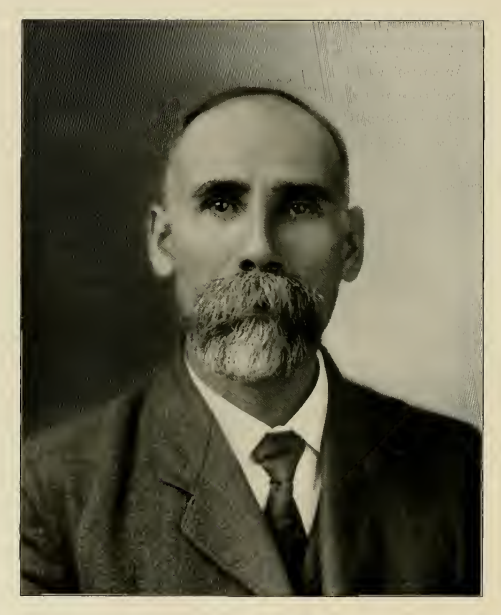
I. a. Pocha