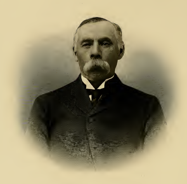
6. P. macy.