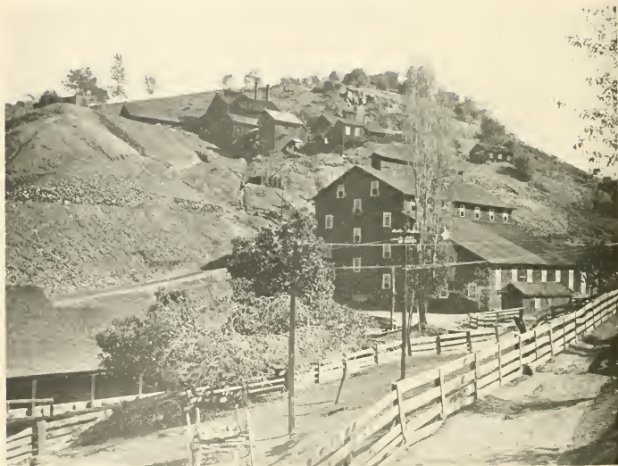
Keystone Gold Mine and 40 Stamp Mill, Amador City, California. Produced over $13,000,000. In operation since 1850.